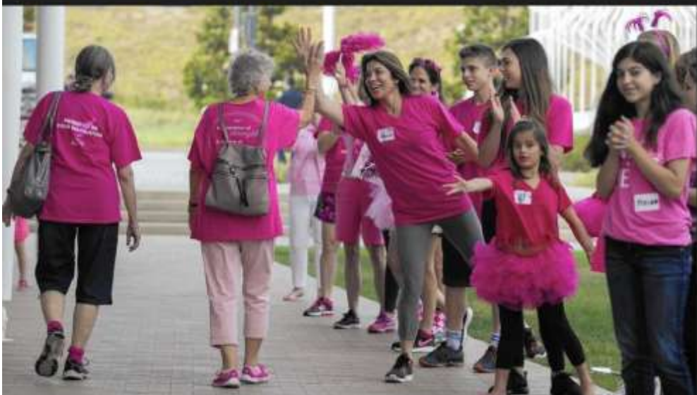
Photo Gallery: Breast cancer survivors, supports create human pink ribbon