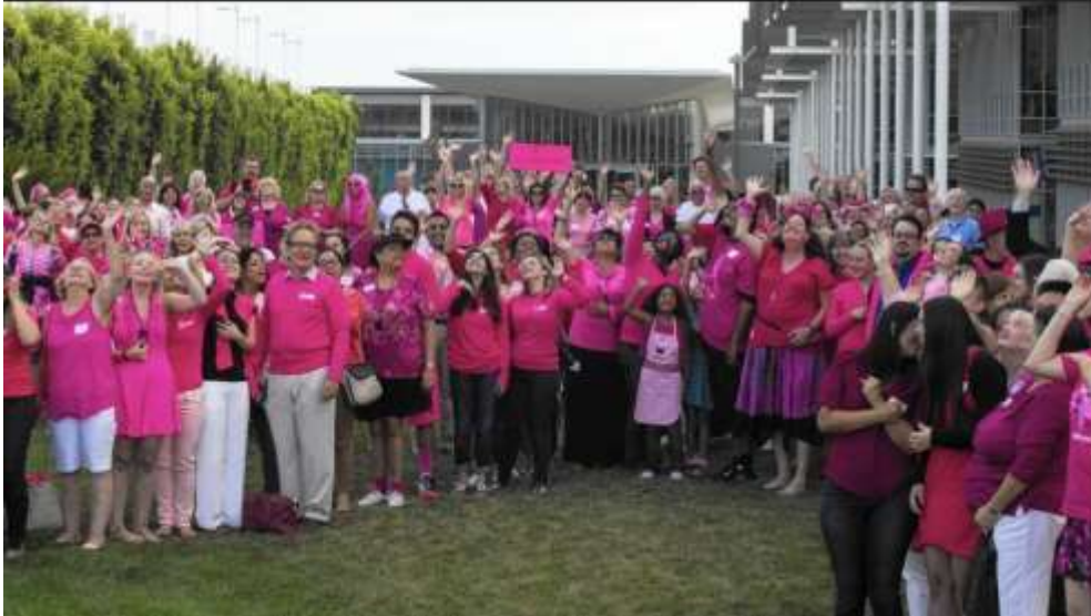
Photo Gallery: Breast cancer survivors, supports create human pink ribbon