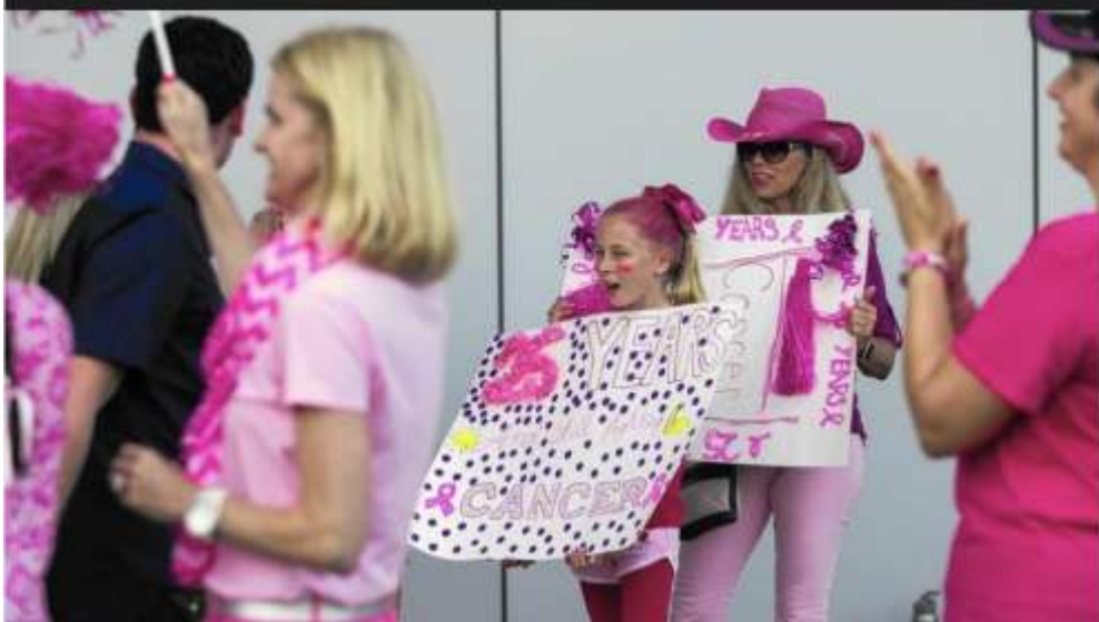
Photo Gallery: Breast cancer survivors, supports create human pink ribbon