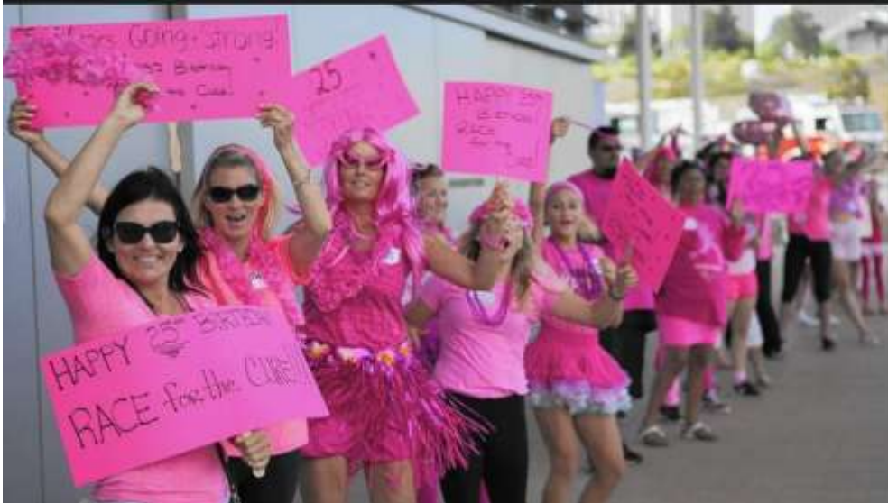
Photo Gallery: Breast cancer survivors, supports create human pink ribbon